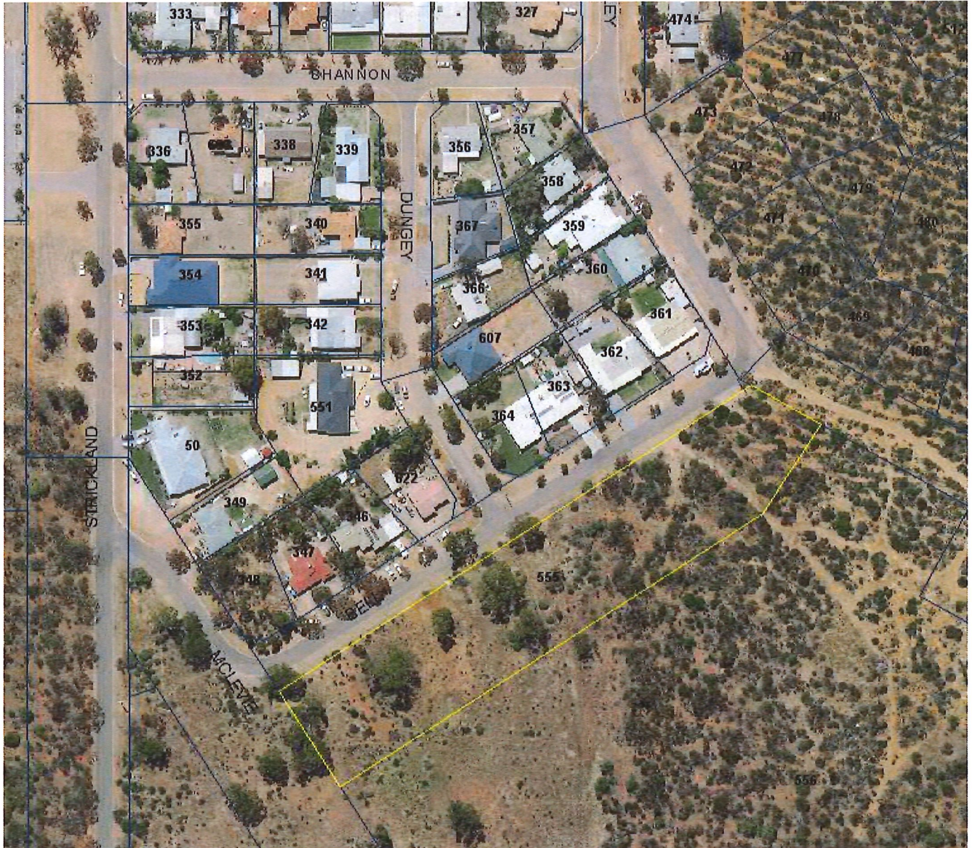
Location of subject property (SynergySoft)