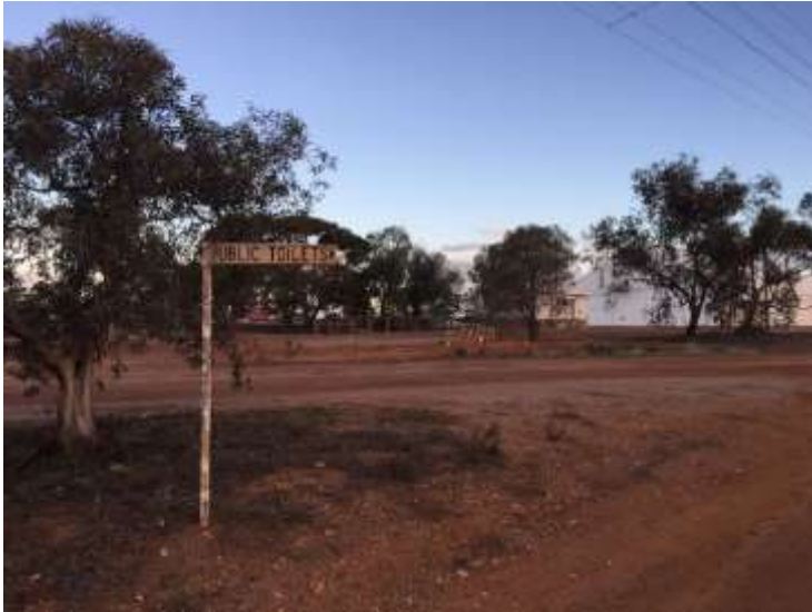
Directional signage, Pithara