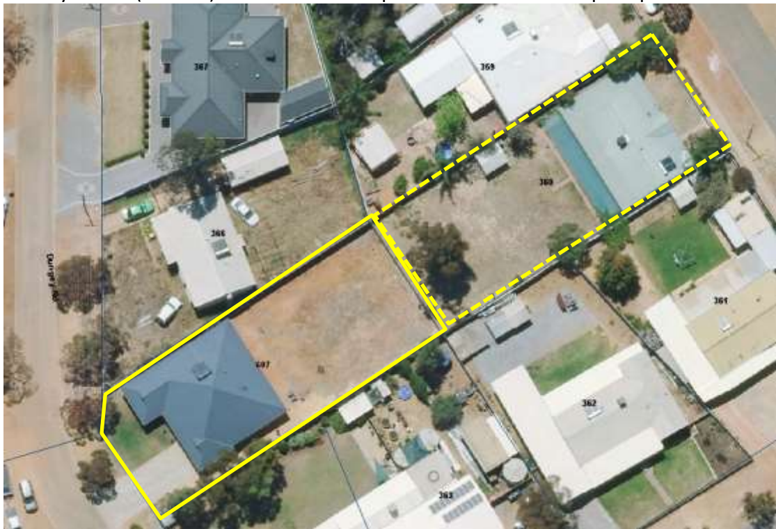
Location of existing allotments 1 Dungey Road (Lot 607) and 2 Wasley Street (Lot 360)

The property on Dungey Road (Lot 607) has been developed with a freestanding single dwelling. The allotment has an area of 1004m 2 with 510m 2 of open space at the rear. Wasley Street (Lot 360) is a similar development with 560m 2 of open space at the rear.