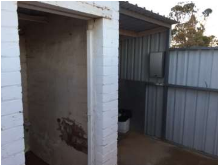
Pithara Town Hall toilets