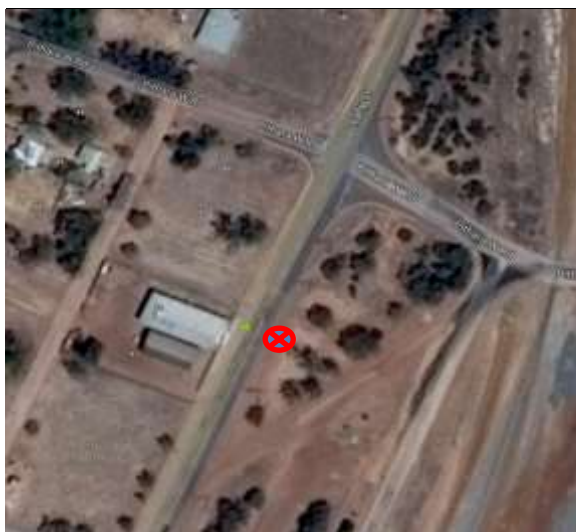
Location of Signage at Pithara

Removal of the signage that indicates the location of the selected ablution facilities to motorists on the Great Northern Highway and Mullewa-Wubin Road would reduce the requirement to maintain those facilities. It is not envisaged that motorists would be overly inconvenienced as suitable public conveniences are located at Wubin (13kms from Buntine) and Dalwallinu (14kms from Pithara).