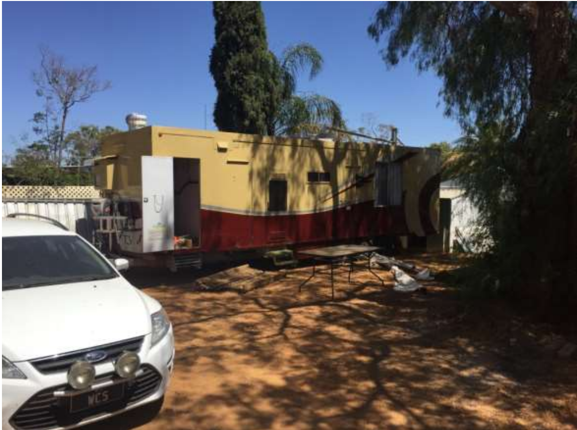
The caravan, subject of the application, insitu at 30 Annetts Road Dalwallinu