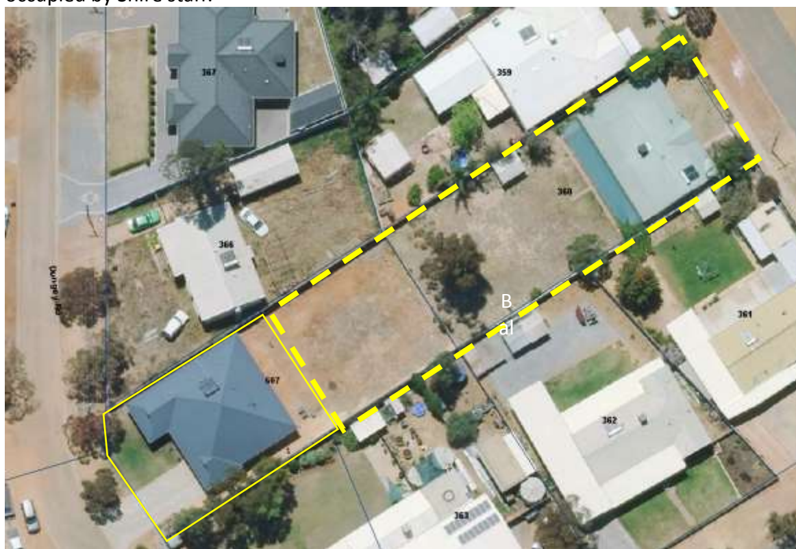
Proposed boundary adjustment betwixt Lot 607 and Lot 360

The balance allotment resultant of the boundary adjustment (incorporating all of Lot 360 and a portion of Lot 607) would provide approximately 924m 2 of undeveloped open space in which to situate 1-2 new grouped dwellings. The new residences would be serviced by extending existing facilities and could be metered as separate entities if required. The additional dwellings would have connection to the public road via a common driveway situated adjacent to the northern boundary. It is intended that the dwellings would be occupied by Shire staff.