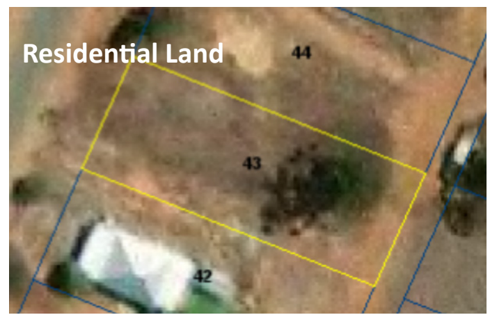
Lot 43 (38) McConnell Street, Pithara Address: Size: 1,012m<sup>2</sup> Price: Accepting Offers (No deep sewerage available)