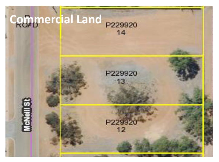
Address: Lots 12, 13 & 14 McNeill Street, Dalwallinu $132,000 each (inclusive GST) Size: 1,012m<sup>2</sup> Price: (Deep sewerage available)

Address: Lot 1001 Deacon Street, Dalwallinu Size: 2,600m<sup>2</sup> Price: $165,000 (inc GST) No offer necessarily accepted.