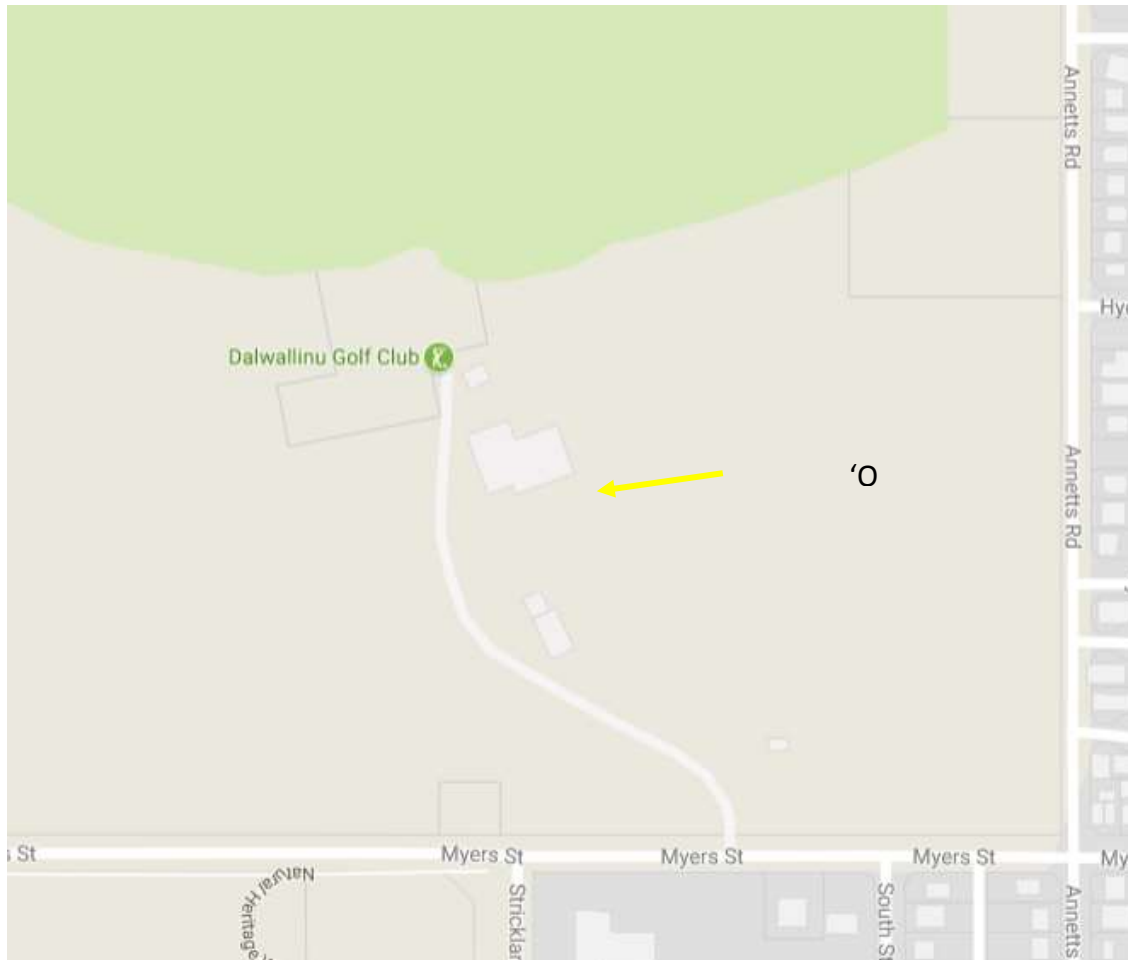
Location of subject building (Google Maps)

The Dalwallinu & Districts Agricultural Society Inc. has written to Council seeking approval to demolish the building known as the 'Old Bar' which is located adjacent to the main carpark at the Dalwallinu Recreation Grounds. It is understood that the building is disused and is superfluous to current needs. It is also understood that no other defined groups have an interest in retaining the building for any purpose.