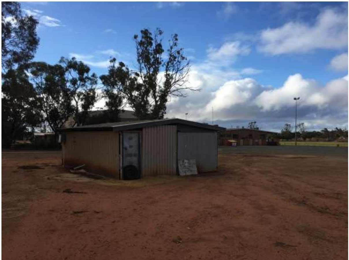
The 'Old Bar' building, Dalwallinu Recreation Grounds

The recommendation is that the Chief Executive Officer be requested to manage the removal of the subject building.