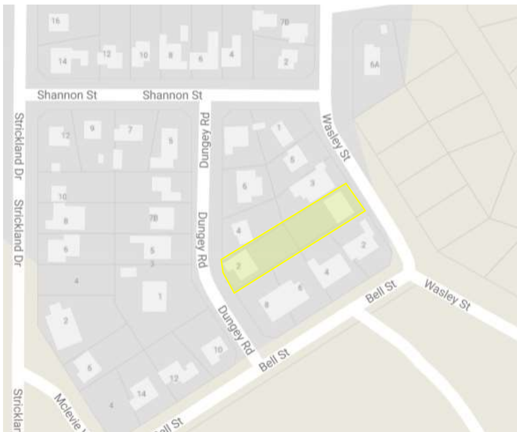
Location of subject properties

The Shire is actively seeking to increase its housing stock to better accommodate staff. An opportunity exists to utilise freehold property currently under Shire ownership. The identified properties have the potential, when consolidated, to allow for the construction of two new dwellings (3x2).