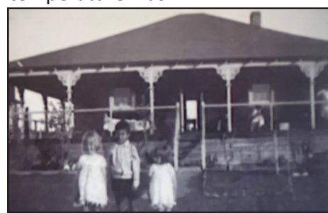
Family home at Rockingham

with that younger people wouldn't understand today she recalled that traditionally every Sunday they would go to church, then have a roast dinner followed by apple pie and cream, and tea would be cold meat and salad. This was every week, no matter what the temperature was.