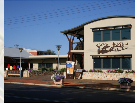
Dalwallinu Discovery Centre