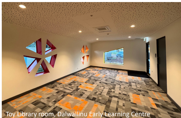
Toy Library room, Dalwallinu Early Learning Centre