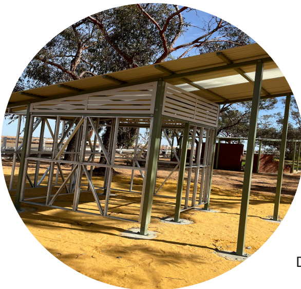
New Ablutions Dalwallinu Cemetery