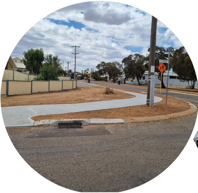
Hyde Street, Footpaths