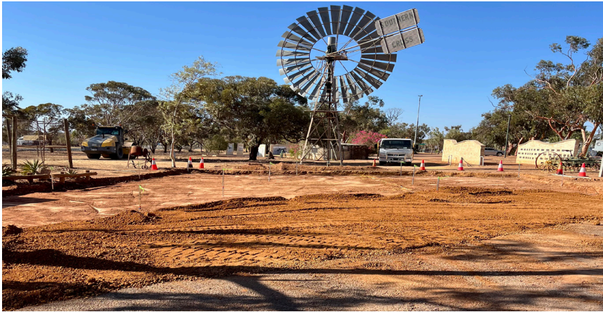
Memorial Park / Park Drive